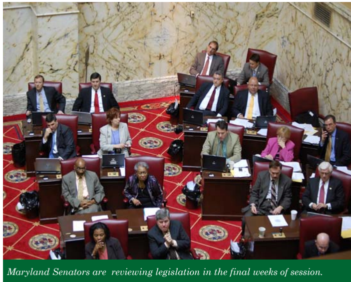
Maryland Senators are reviewing legislation in the final weeks of session.

Maryland School Bus Contractors Association: The association supported a bill creating increased penalties for assaulting transit and school bus operators. They also monitored all school safety and transportation initiatives.