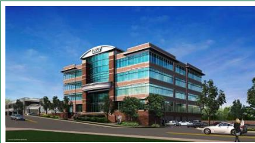
CPJ completes plans for a new energy efficient building.

most recent project received a gold standard from LEED, the highest recognized standard in the state of Maryland.